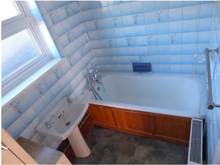
Enclosed bath with mixer tap and shower attachment, tiled walls, double glazed window, access to loft.