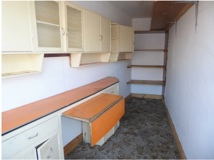
Wall and floor mounted unit, power and lighting.