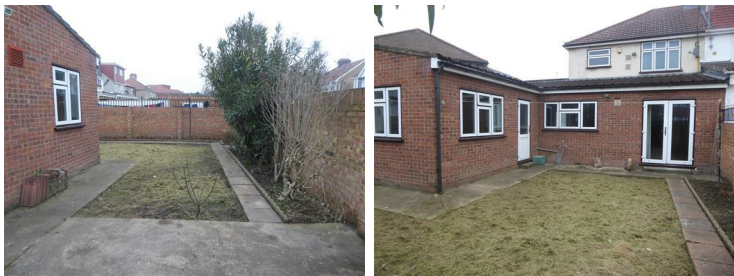
Concrete path, rest laid to lawn area, rear access.