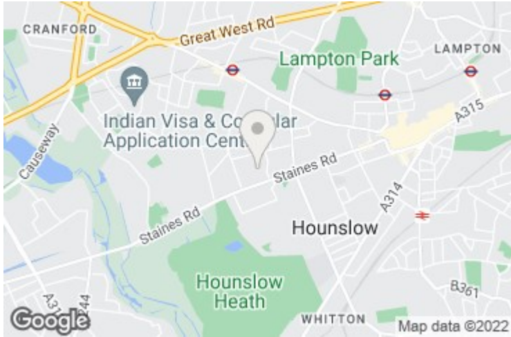
Own driveway with off street parking for at least two cars, further block paved area with shrubs.